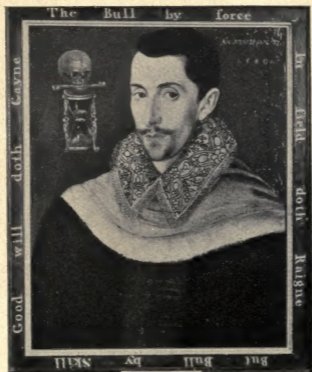
DR. JOHN BULL

From the painting in the Music School, University of Oxford.